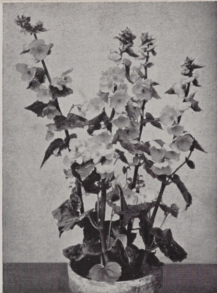
Begonia Martiana Grandiflora or Hollyhock